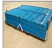
POLMIL® Panel 3m High x 2.5m