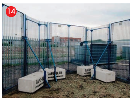
90 degree and 135 degree Corner Panels.