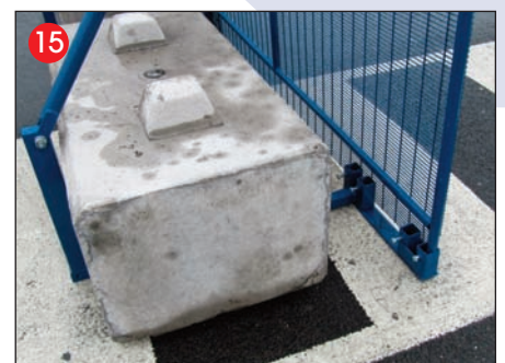
Start/Stop Bracket option for end of line.