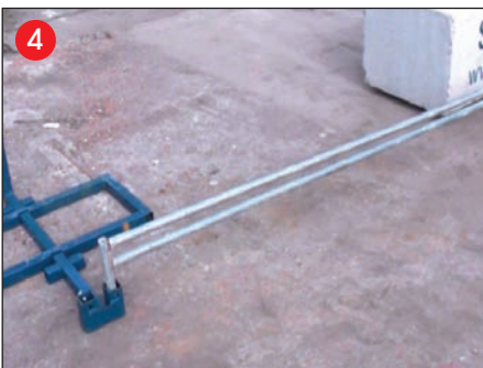
Repeat 1 and 2 using the Spacing Tool to ensure correct distance.