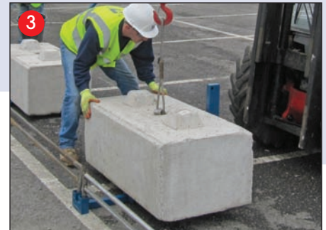
Place Ballast Block onto Base and Loading Tray (Not more than 50mm from backstop).