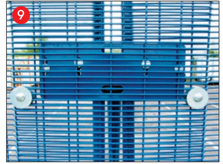
Attach Cover Mesh over Clamp Plate and Panel gap using M8x50 Coach Bolts with M12x50 washers (attack side), M8 Full Nuts and M8x50 washers (inside).