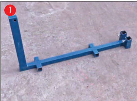
Position Base on Ground.