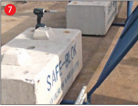
Insert Panels into Base. Manual lifting Note: Each Panel weighs 98kgs.