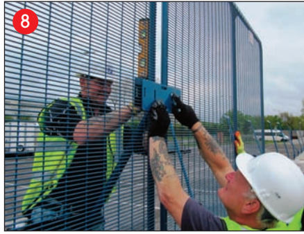
While assistants hold panels vertical, fit 4no. M8x70 Coach Bolts through Front Clamp Plate, Panel Mesh and Brace Plate using Nyloc Nuts and M8x50 Washers behind.