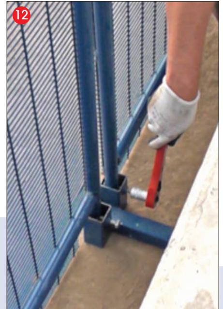
Tighten M10 captured bolt securely against Panel leg to prevent lifting. (Recommended Torque: 22N m, 16.2ft lb)