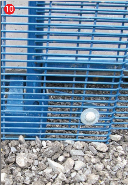
Bottom Cover Mesh bolt to be no more than 50mm from ground.