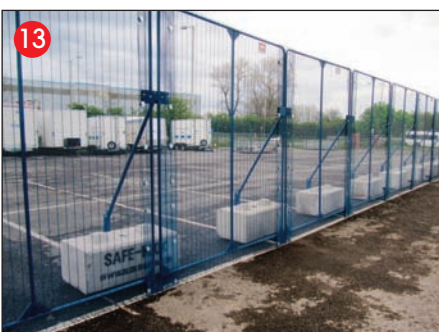
Repeat until Fence line is complete.