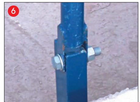
Connect Brace to Base using M16 Hex Bolt and Washers.